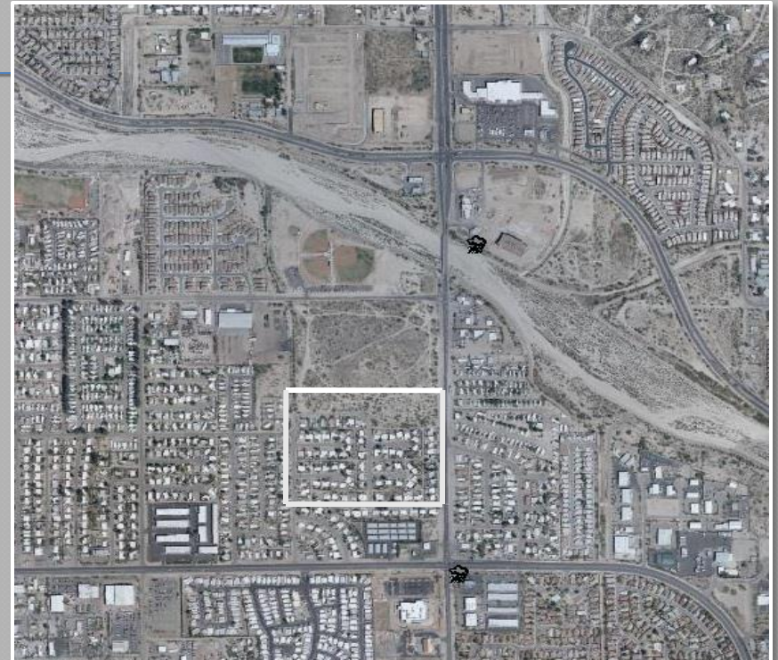
Aerial – Surrounding Area

Existing zoning- SH(Suburban Homestead) and MU (Mixed Use). The central and northern portions of the site are zoned SH which is a low density residential area, allowing only one house per 4.13 acres of land area. The southwest and southeast portion of the site are zoned MU, which allows for a variety of residential, commercial, and industrial uses.